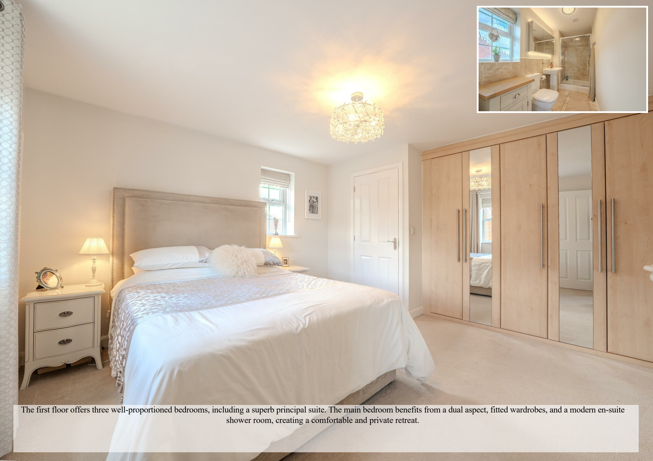
The first floor offers three well-proportioned bedrooms, including a superb principal suite. The main bedroom benefits from a dual aspect, fitted wardrobes, and a modern en-suite shower room, creating a comfortable and private retreat.